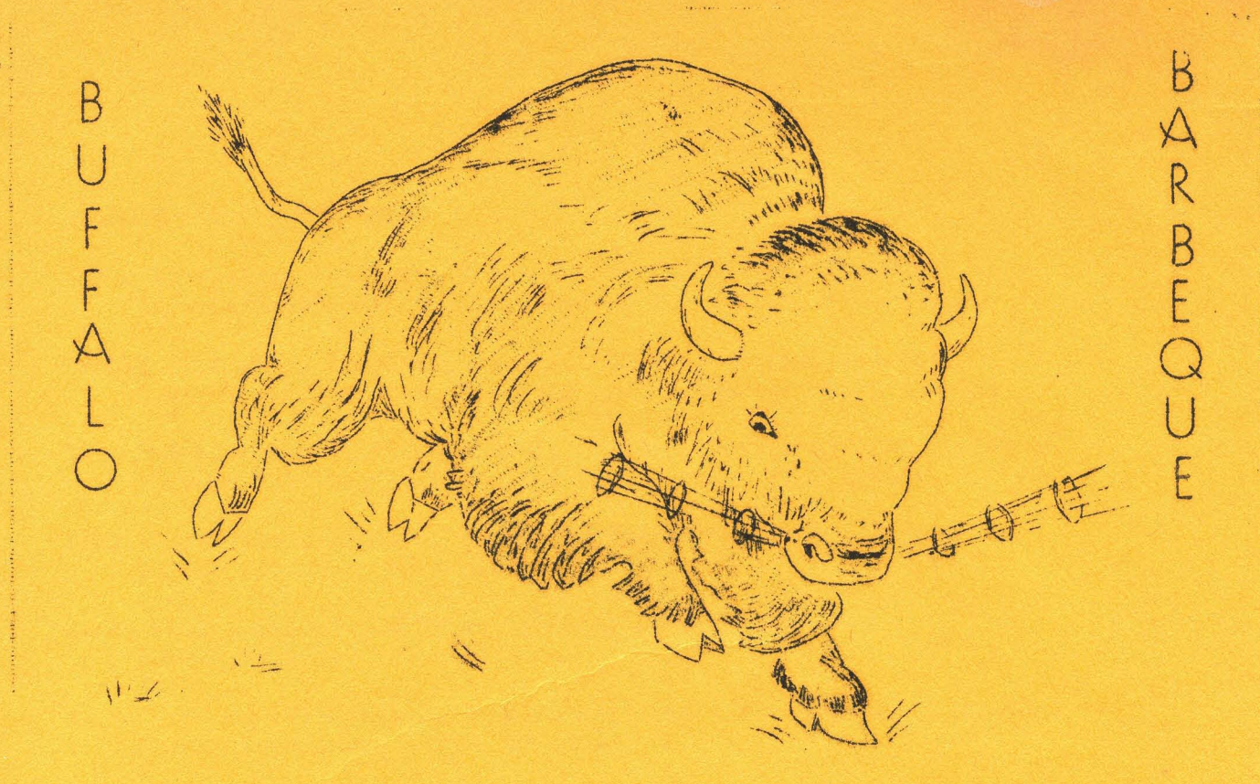
LET'S GO!! GO WHERE? TO THE BUFFALO BARBECUE AT PRATT! WHEN?