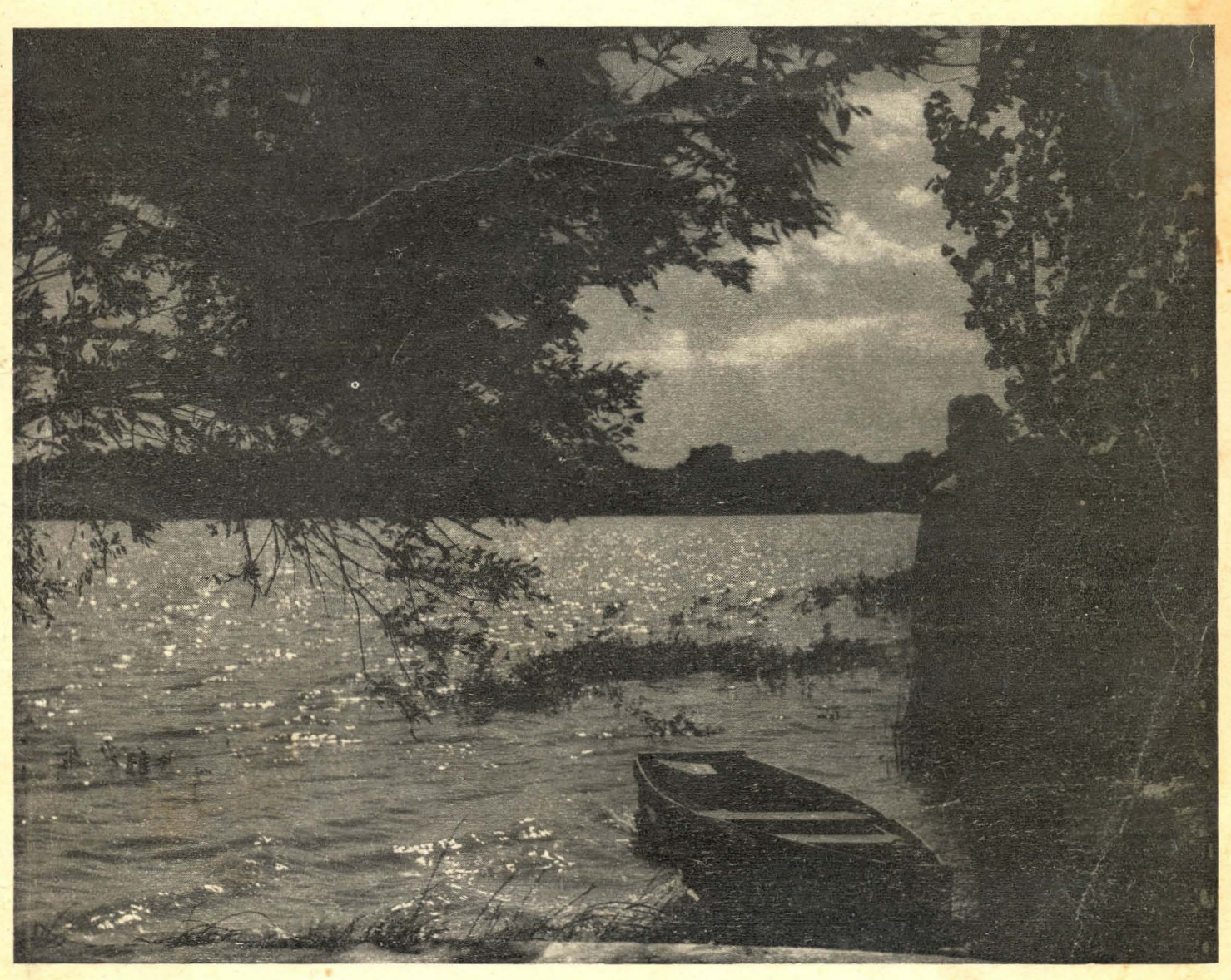
Meade County State Park.